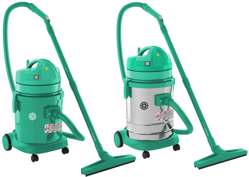
GP 1/27 HEPA ISO5