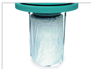
HEPA H14 CARTRIDGE WITH POLYCARBON PREFILTER