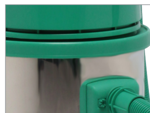
ANTIBACTERIAL PLASTIC AND STAINLESS STEEL AISI 304