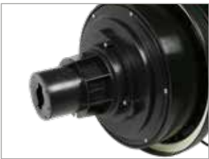
HEAD WITH ANTI FOAM SYSTEM