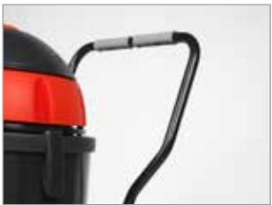
TROLLEY WITH HANDLE