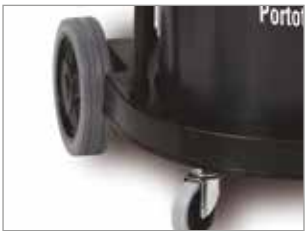
LARGE REAR WHEELS